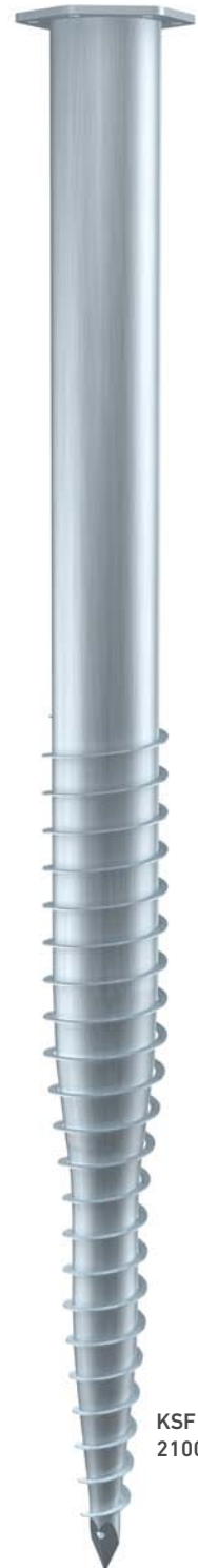
KSF M 140x 2100-M24