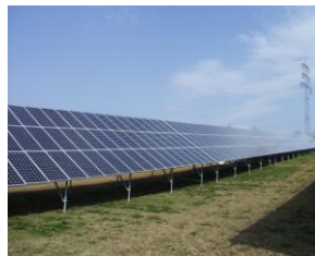
3- tiers PV-system