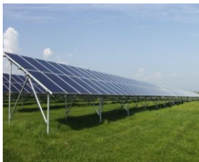
2- tiers PV-system

Kind of module: polycrystalline monocrystalline amorphous